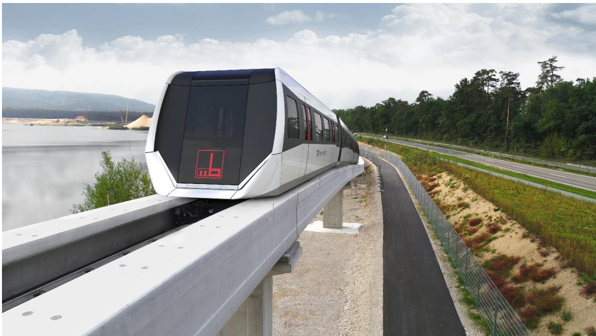
TSB on test track in Sengenthal, Germany.