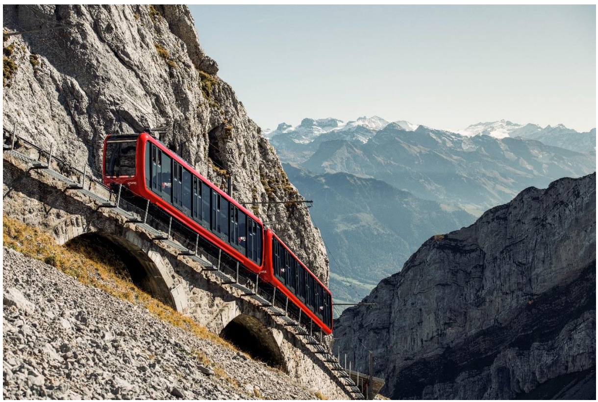
A new train at Pilatus Railways.